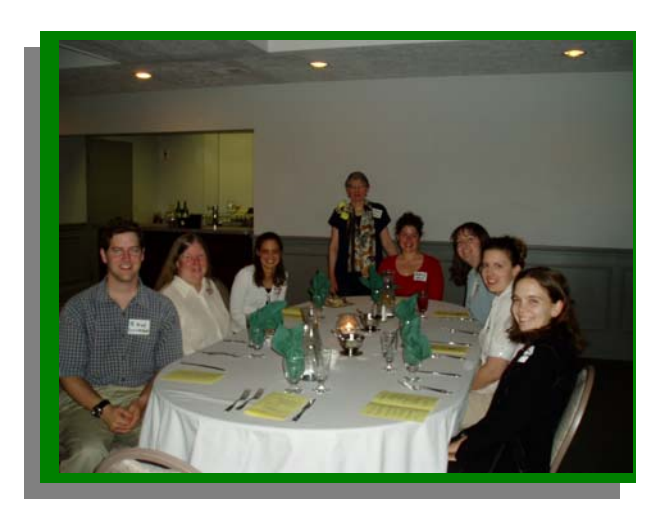
Scenes from the 2006 Geography Banquet