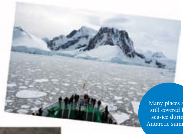
Many places are still covered by sea-ice during Antarctic summer