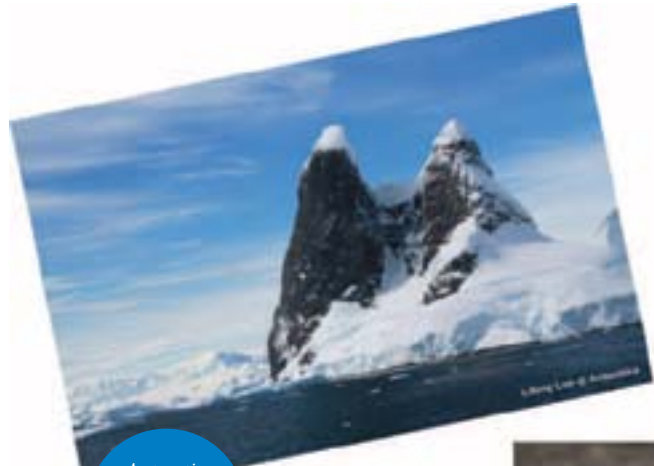
Antarctic mountains are unique & beautiful.