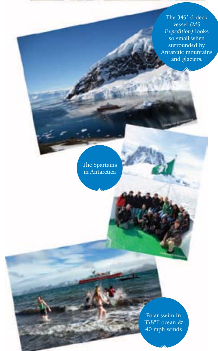
The 345' 6-deck vessel ( MS Expedition ) looks so small when surrounded by Antarctic mountains and glaciers.

The trip is all about experiencing Antarctica—the only continent that humans are not the residents. Perhaps because of this, the pure beauty of Antarctica is beyond what words and pictures can depict, and can only be appreciated by seeing and feeling it in person.