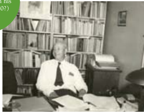
An unknown geographer in his office (c. 1950?)