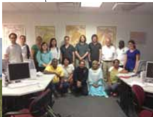
► Pre-Symposium Workshop on GIS and Health in Geo Dept.