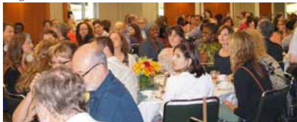
► Banquet Dinner at MSU Stadium Tower.