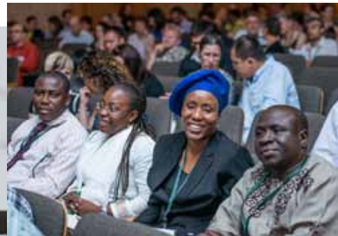
► Opening Plenary Session in Kellogg Auditorium.